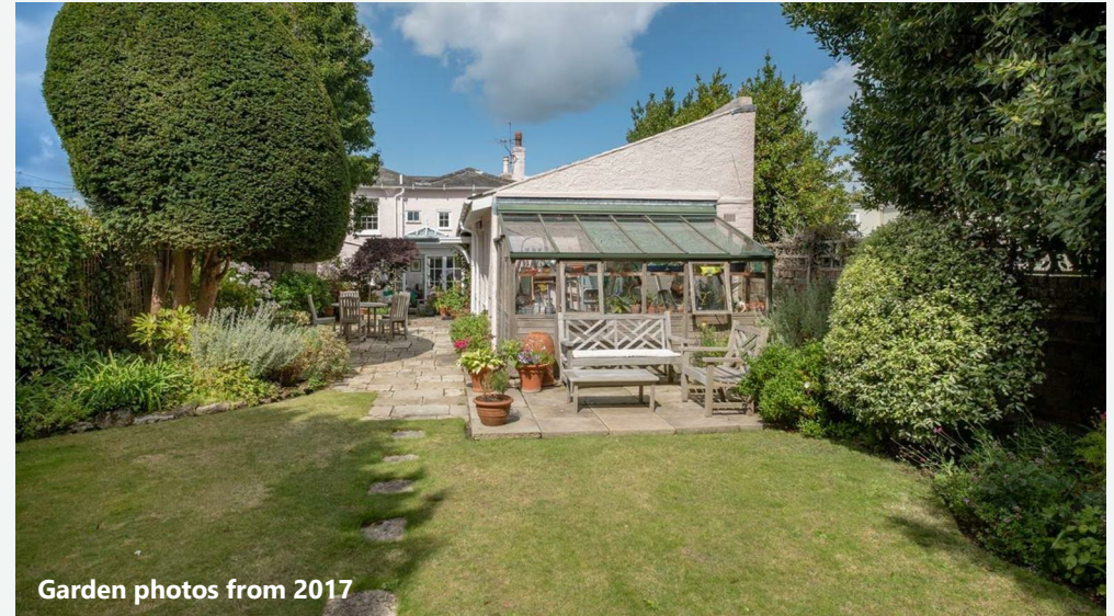
Garden photos from 2017